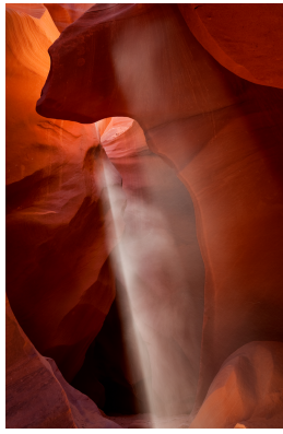
Spirit Light, Antelope Slot Canyon, nr. Page Arizona