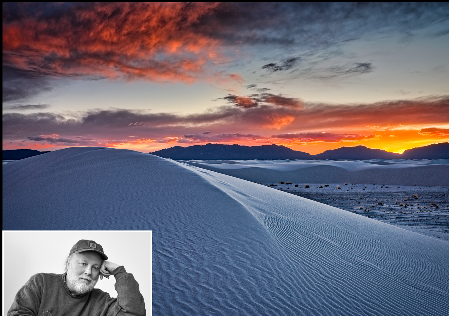
Red Sky and Dunes at Sunset, White Sands National Monument, New Mexico